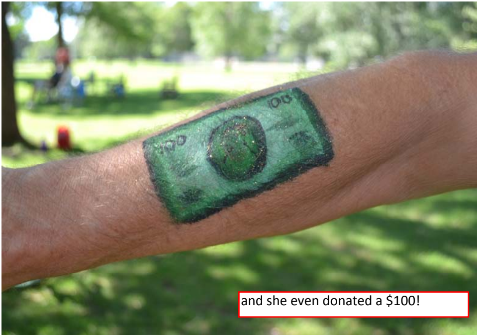
and she even donated a $100!