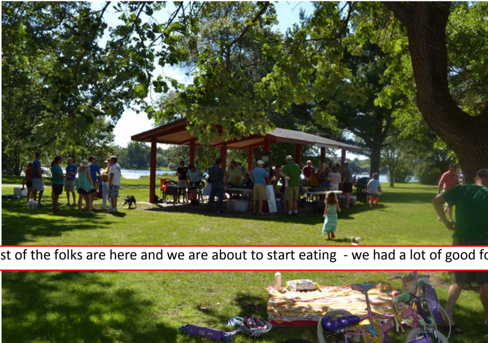
most of the folks are here and we are about to start eating - we had a lot of good food.