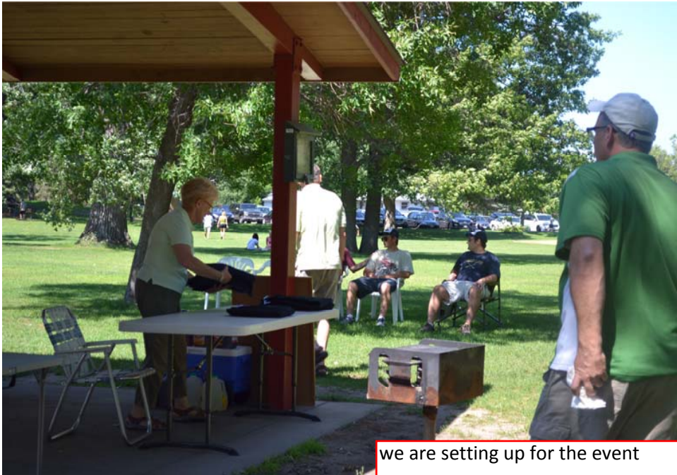
we are setting up for the event