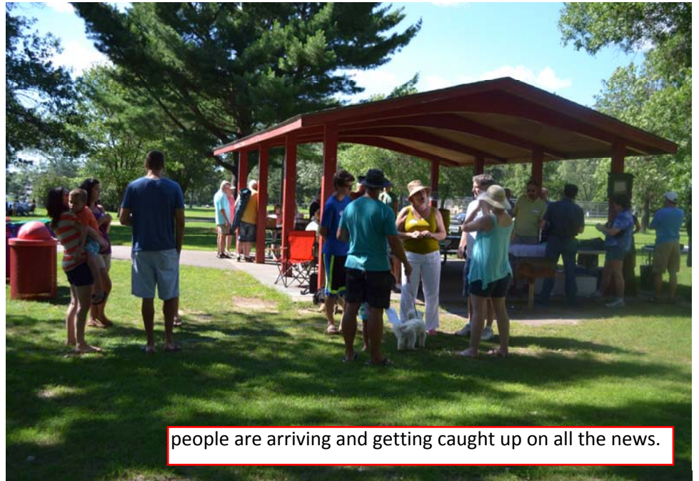
people are arriving and getting caught up on all the news.