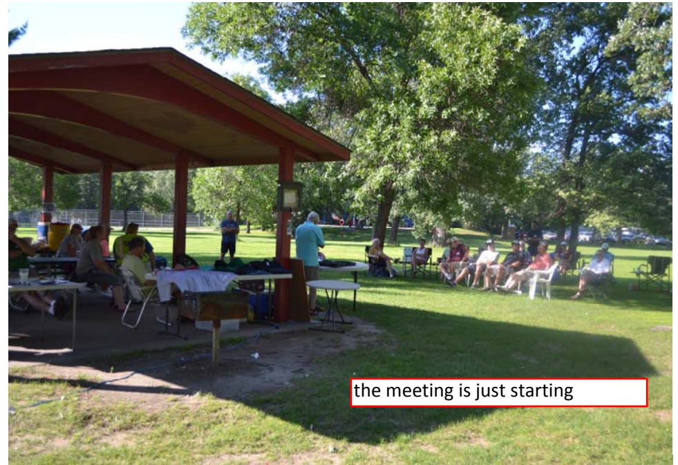
the meeting is just starting